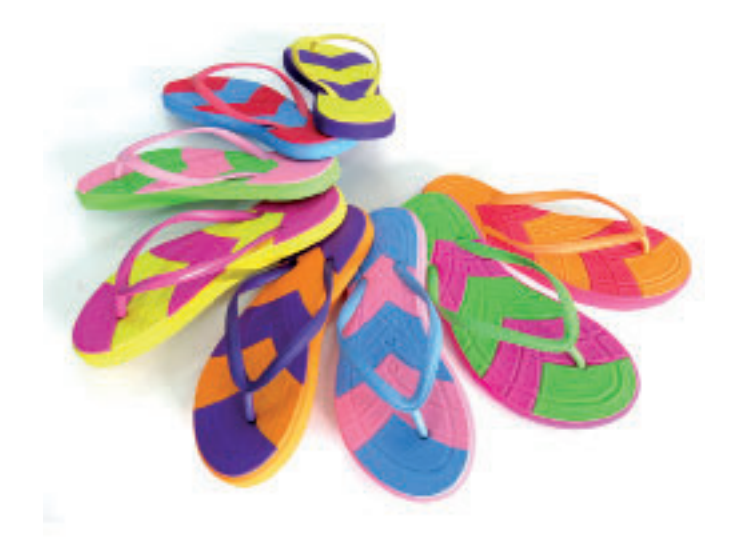
FG - 1826